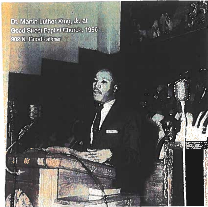
Dr. Martin Luther King, Jr. at Good Street Baptist Church, 1956 902 N. Good Latimer